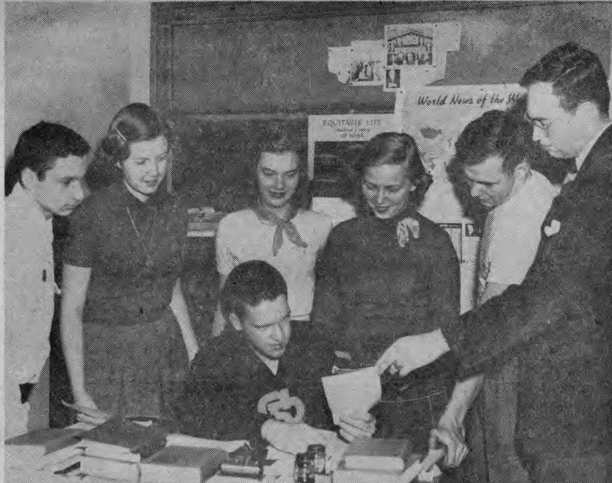
Economics class students keep a watchful eye on stock market reports as they learn and apply business rules to their individual "investments."