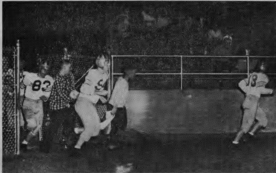
Eager to get the football season underway, the varsity players run onto School Field.