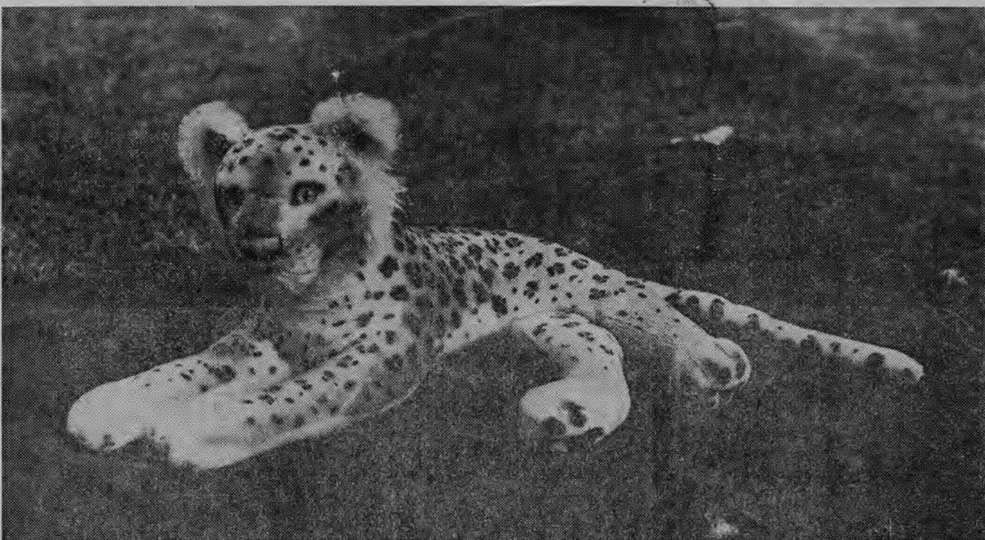
"Willy" the Wildcat seems to have that look in his eye that spells trouble for the opposition.