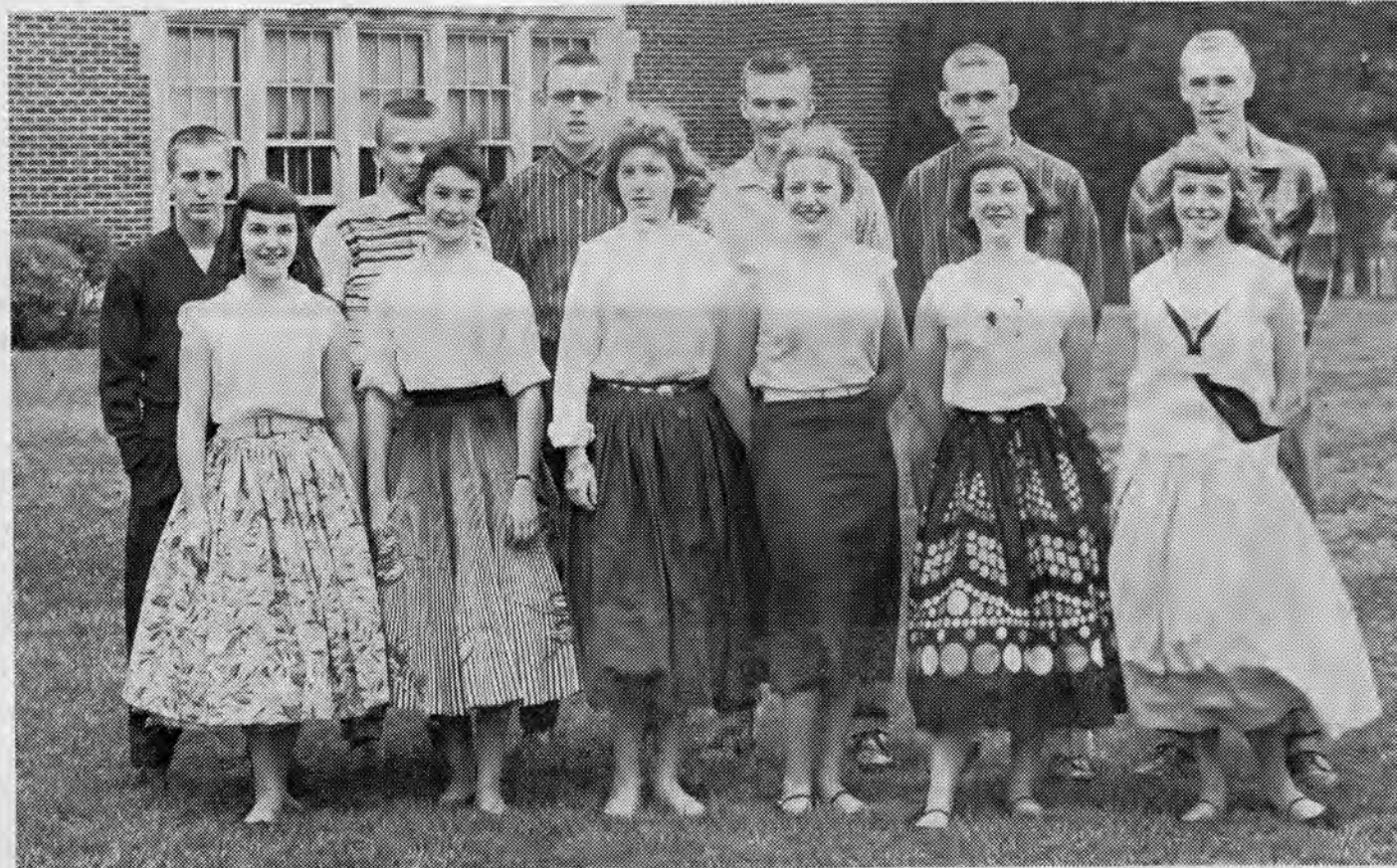
From this group of Juniors the Prince and Princess of the Junior Prom will be announced tomorrow night. Court mem-