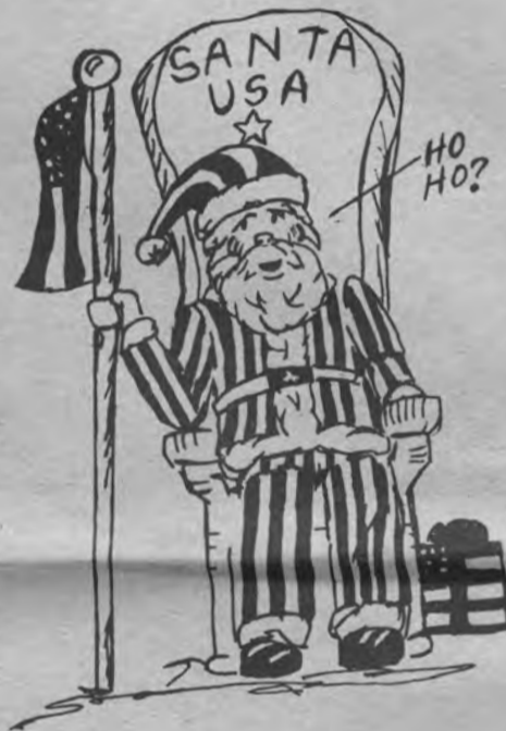
Merry Christmas '76

Girls volleyball is an important concern of a significant part of Riley. It is really too bad that our graduating volleyball girls may have been the best girls' team in the state, but never had the chance to prove it.