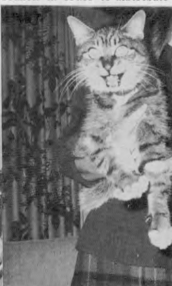
Showing off for the cameraman is the "ferocious" cat which will serve as Riley's mascot.