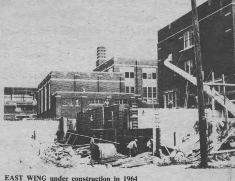
EAST WING under construction in 1964

special system of tabulating the votes so that a Negro was on the court.