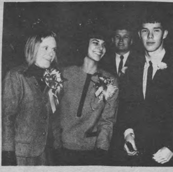
STUDENTS at 1966 football homecoming dance.

For all the many persons who have real phobias, there is available help from doctors or clinics. For those who don't need professional help, forget about your "phobia."