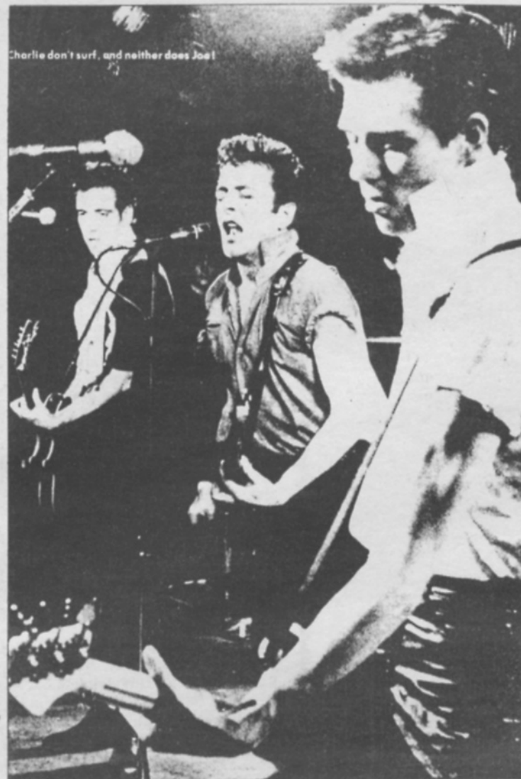
MICK JONES, Joe Strummer and Paul Simonon of The Clash.

Indeed, it's a pity that the giving part of Riley is not being tapped to its fullest. Apparently selling candy and raising money for various student causes is no trouble. If more attention and time were turned towards raising money and collecting necessities to give away at this time of year, there would be a huge success and Riley would be looked up to by the other schools, the community, and the entire city.